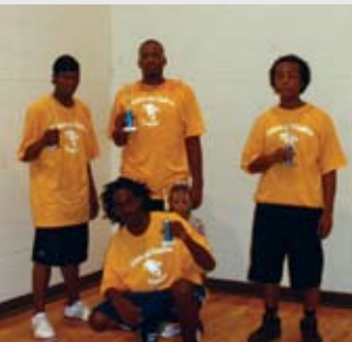
Center participants pose after winning 2009 basketball tournament

The agency also established a six-workstation computer lab at the new eastside location.