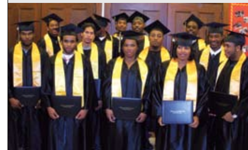
Class 90 GED Program participants pose at recognition ceremony.