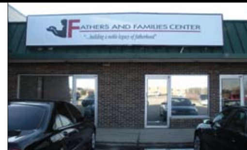
Fathers and Families Center's new 38th and Mitthoefer Road location.

The Center's Healthy Marriage Program "It Takes Two!" has made outstanding achievements in 2009. With the enrollment of its 240th couple, the program has exceeded its goal set by the federal government by 152%. The Healthy Marriage Education Program was started in 2007 to provide support for couples who are expecting a child and want to improve their relationship skills. The program offers an extensive curriculum designed to improve parenting and relationship skills, allowing couples to better cooperate in care of their child.