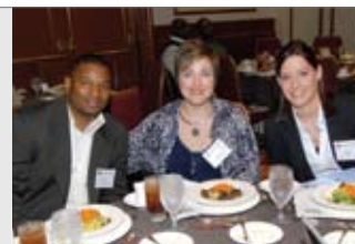
2009 Faces of Fatherhood Luncheon